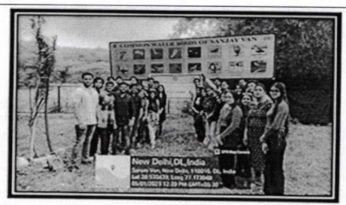
Students Participate in Awareness Drive at "Neela Hauz Biodiversity park"