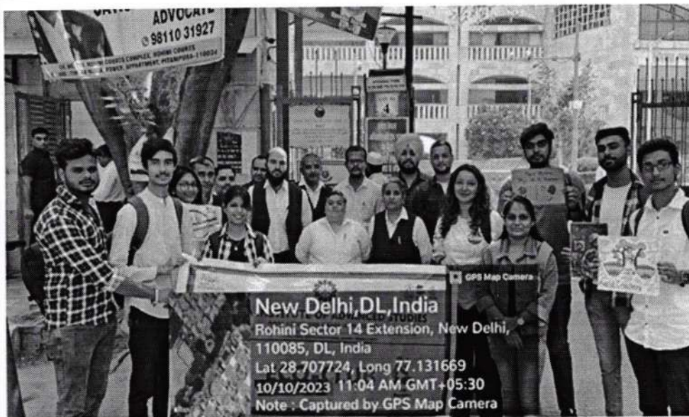
Group photo session of students

Report (Description in 250 to 800 words)