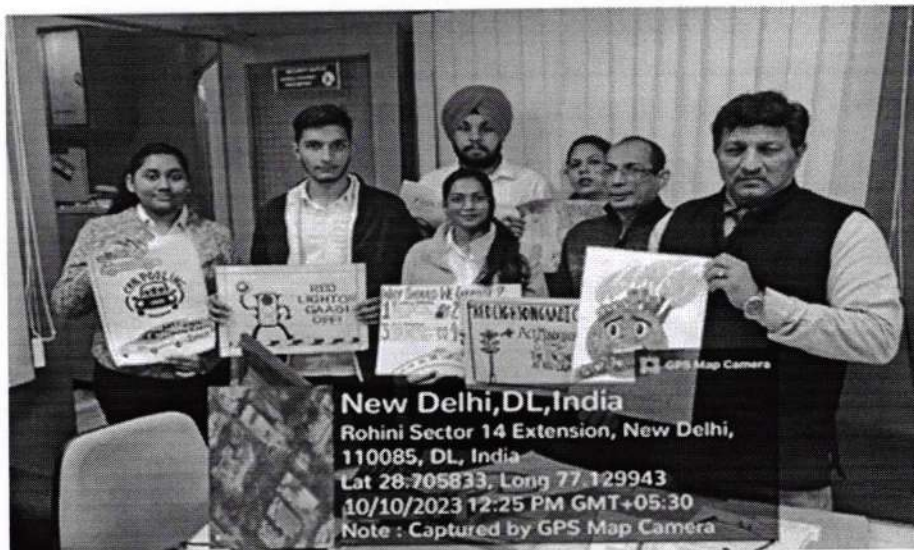
Students initiating the event from the institute