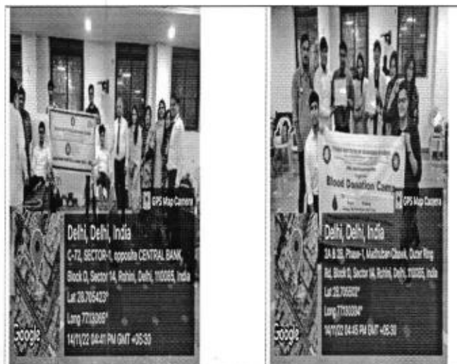
Students participating in Blood Donation Camp