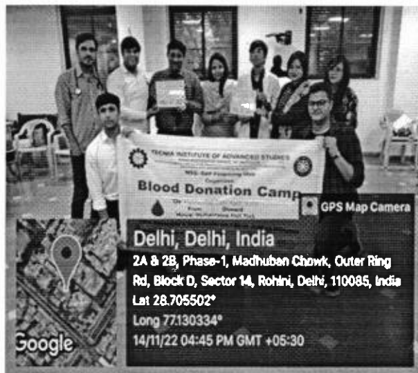
Students taking oath to actively participate in Blood Donation activities.