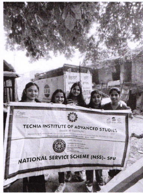
NSS Students after distributing Essentials