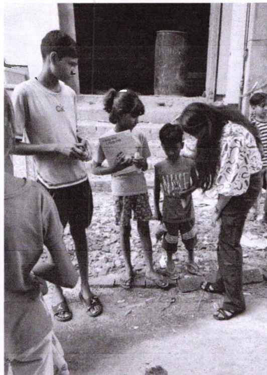
NSS Students Distribute Essentials for a Better Tomorrow