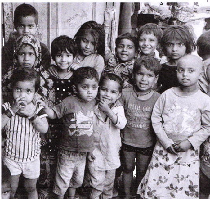
Every Girl's Right to Learn