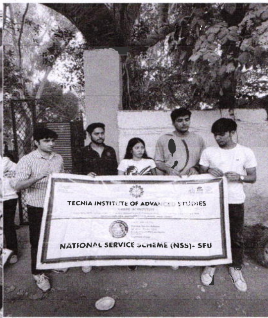
NSS Volunteer promoting Gils Education