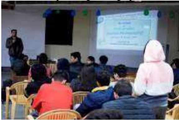
The participant asking question in the Question Answer Round