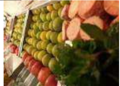
Student's Photographs during the workshop