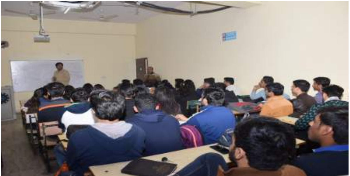
briefing about the CAT Examination Pattern