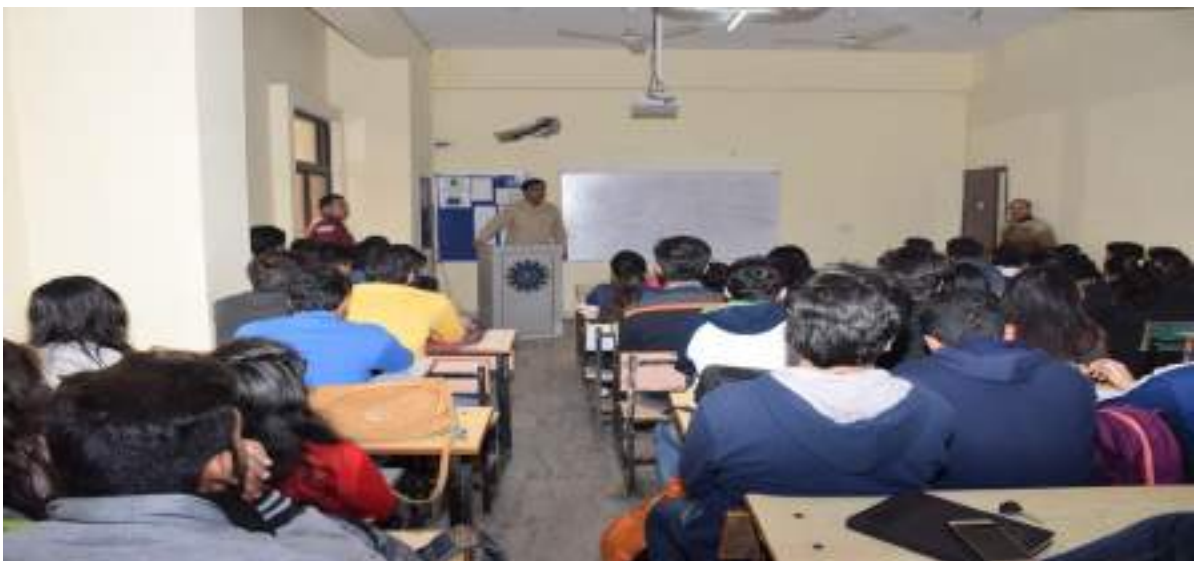
interacting with the students