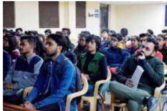
the scenes to the upcoming Photographers