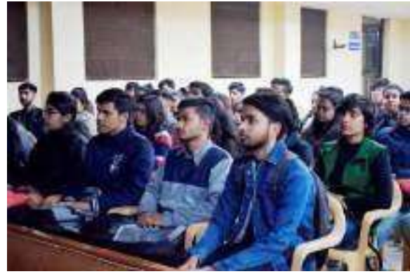
The upcoming Photographer listening cautiously to the resource person.